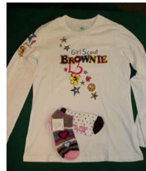
How cute is this Brownie T-Shirt with socks to match! We have more designs as well!