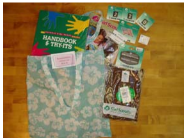
Starter Kits—Everything you need to start you off right in your new level of Girl Scouts.

Come Let Us Dress You in Style and for 15% off! September 16-18 ONLY! (15% off applies to Girl Scout Uniform Pieces and Books)