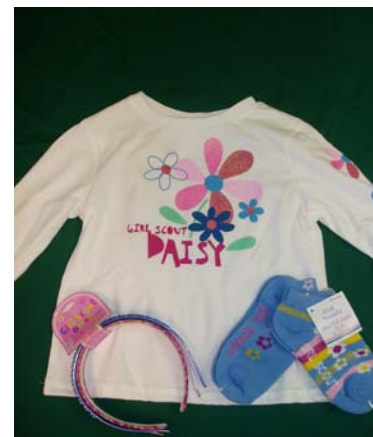
We have a nice selection of Daisy wear and accessories that match.